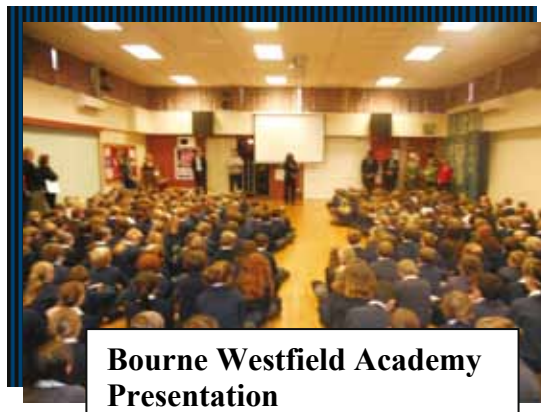
Bourne Westfield Academy Presentation

Following the day's presentation they both took centre stage at The Corn Exchange in the evening and enthralled the capacity audience with their stories. We were very pleased with the success of the day's events and are most grateful for Steve and Tessa's co-operation with the event. The total cost of the day's events amounted to £10,817.