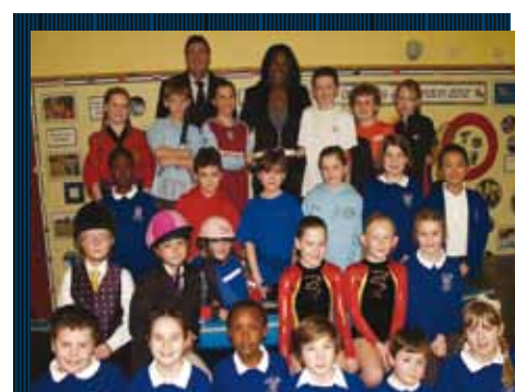
(Above) Young Olympians from Bourne Abbey Academy